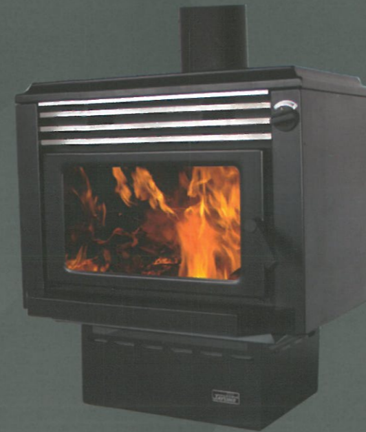
Classic CA clearance requirements with 1200mm flue shield